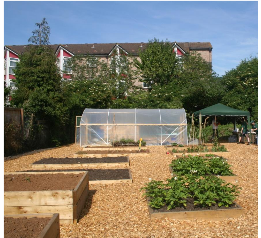
New development, Swindon

Bristol Site Allocations & Development Management DPD 2014