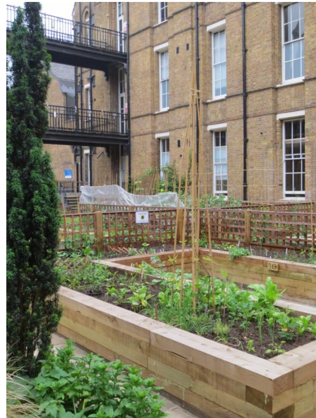
Community Kitchen Garden, North Kensington