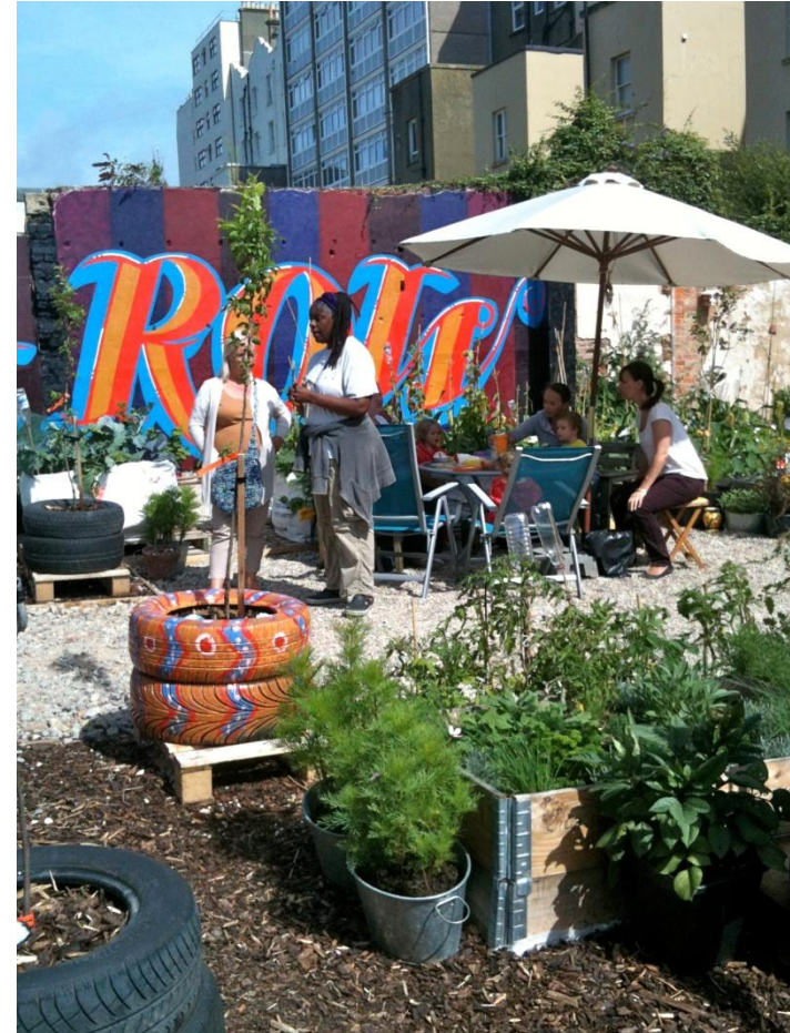
Meanwhile garden, Hastings