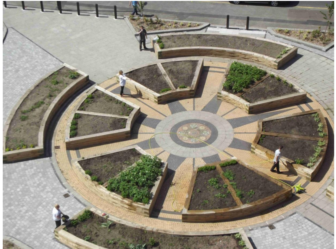
Holland Street Garden, Miles Platting, Manchester