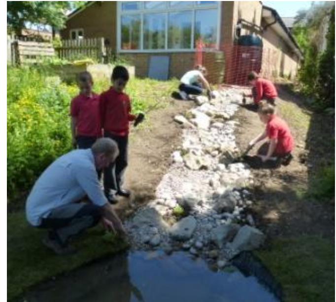
SuDS in Schools