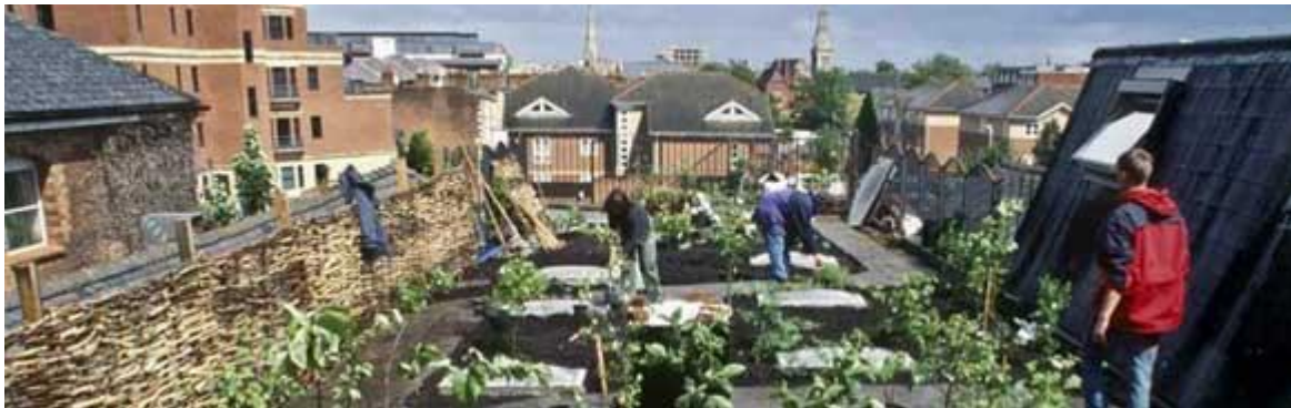
Roof Garden, Reading