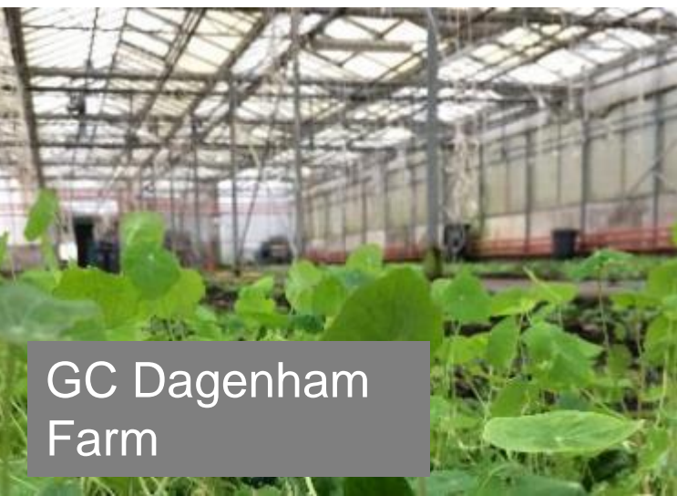
GC Dagenham Farm