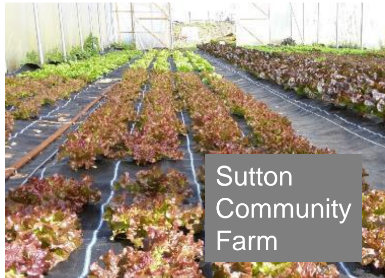
Sutton Community Farm