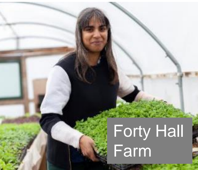
Forty Hall Farm