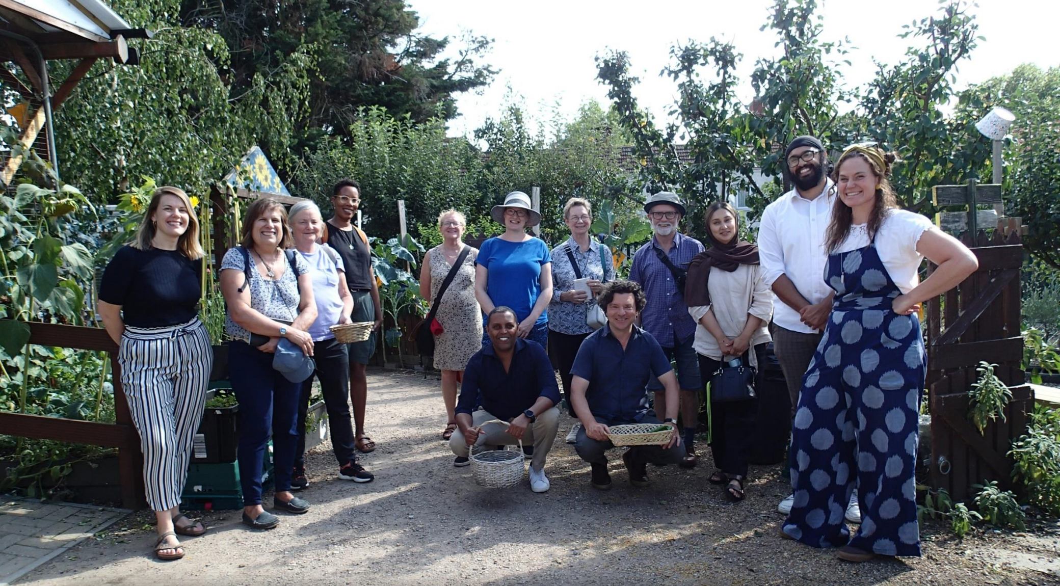
Sufra St Raphaels Networking Tour – August 2024