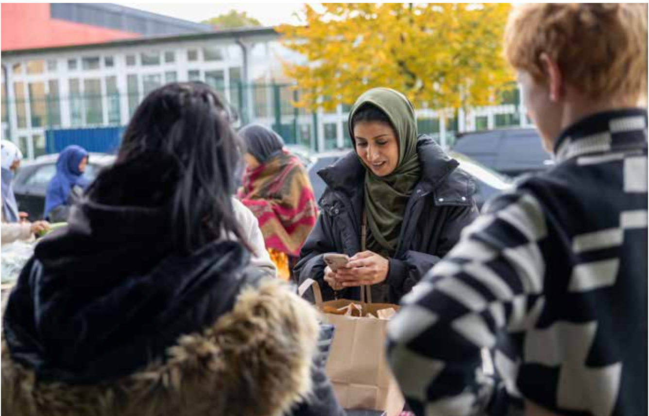
Buying veg at the Tower Hamlets Food Co-op

In year two the pilot focused on the Teviot Centre, increasing the number of operating days and with it the number of customers which have continued to grow steadily throughout the pilot.