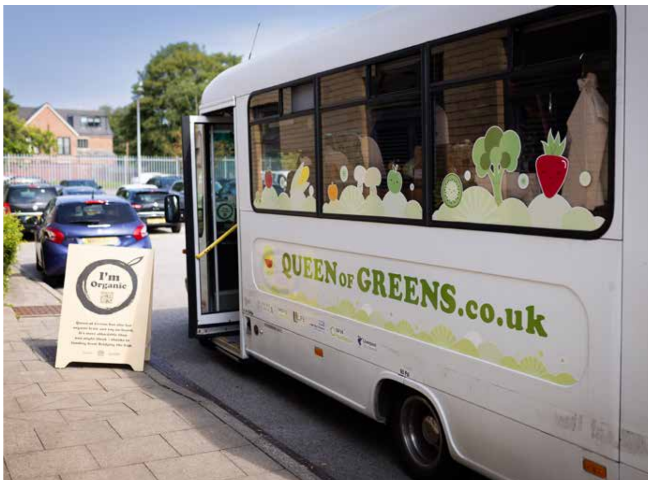
Queen of Greens bus advertising organic at one of its regular stops

worked with Manchester based wholesaler, Organic North, to introduce organic fruit and veg onto the bus at the same price as non-organic. The bus also accepts Alexandra Rose and Healthy Start vouchers.