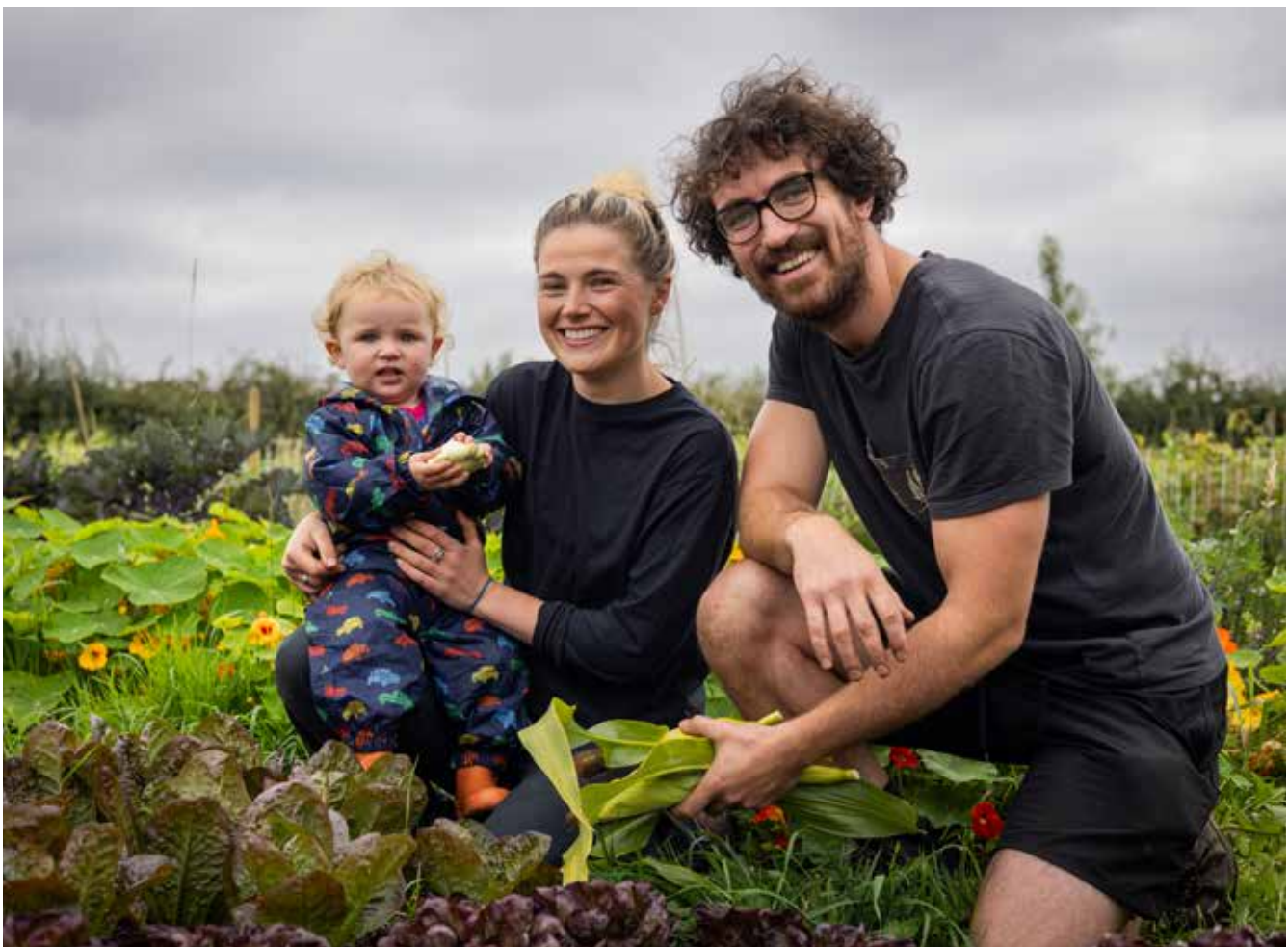
Members of Newtownards CSA and accessible vegbox scheme

From July 2024, people experiencing low incomes in Newtownards could become members of the weekly vegbox scheme at a 50% discount on the standard price. Members received a share of the farm's produce based on what is ready for harvest that week. The scheme reached 98 people across 31 households, running across 29 weeks (one season).