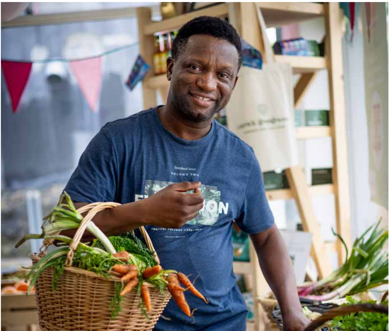
Filling up on veg at Carrick Greengrocers

Bridging the Gap, it launched its Friendly Food Club offering people experiencing a low income a 50% discount on organically produced fruit and veg.