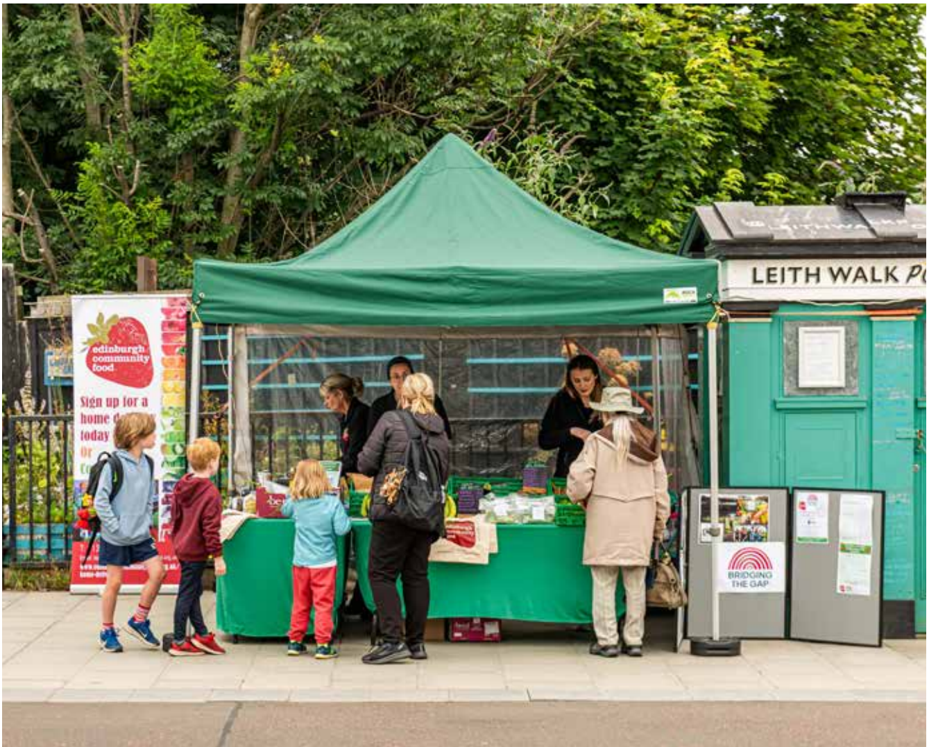
Organic veg stall on Leith Walk, Edinburgh

range it is able to offer which increased the weekly footfall. It also runs box deliveries, supporting people with mobility, caring or other access barriers.