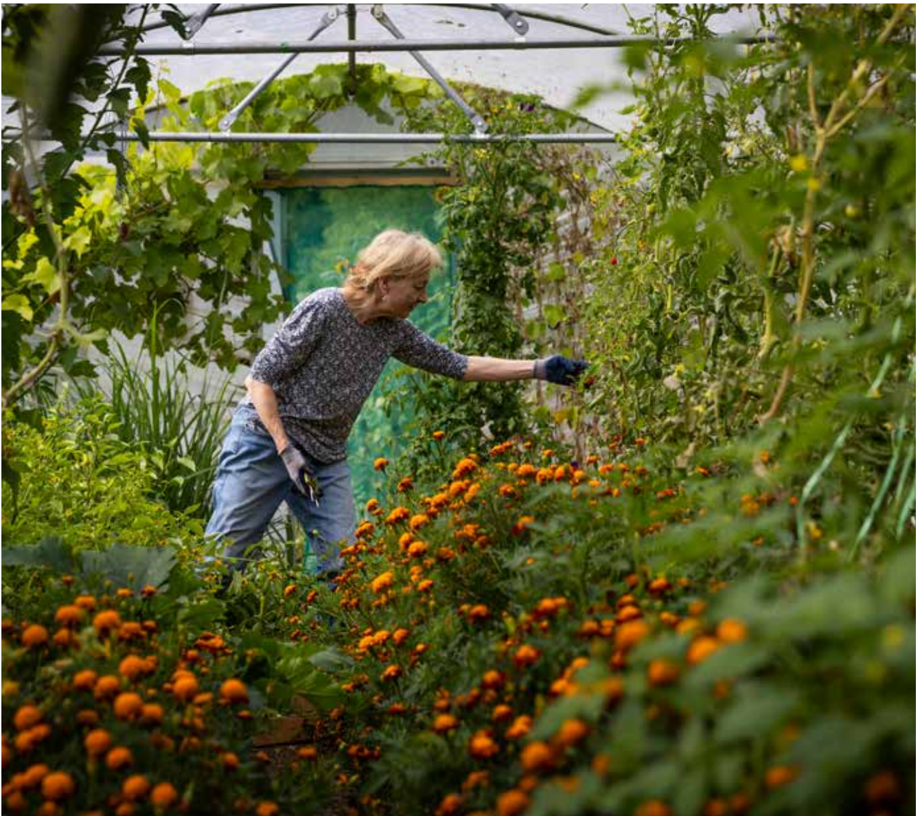
Picking organic tomatoes for Edinburgh Community Food

Greenhouse gas emissions also reduce as nitrogen fertiliser production and application accounts for 52% of agricultural energy consumption for crops like wheat. 16 Organically farmed soils also store up to 30% more carbon compared to industrially farmed soils. Growing the demand for organic will result in a higher proportion of our domestic fruit and veg being grown to higher climate and nature standards, supporting the transition to agroecology.