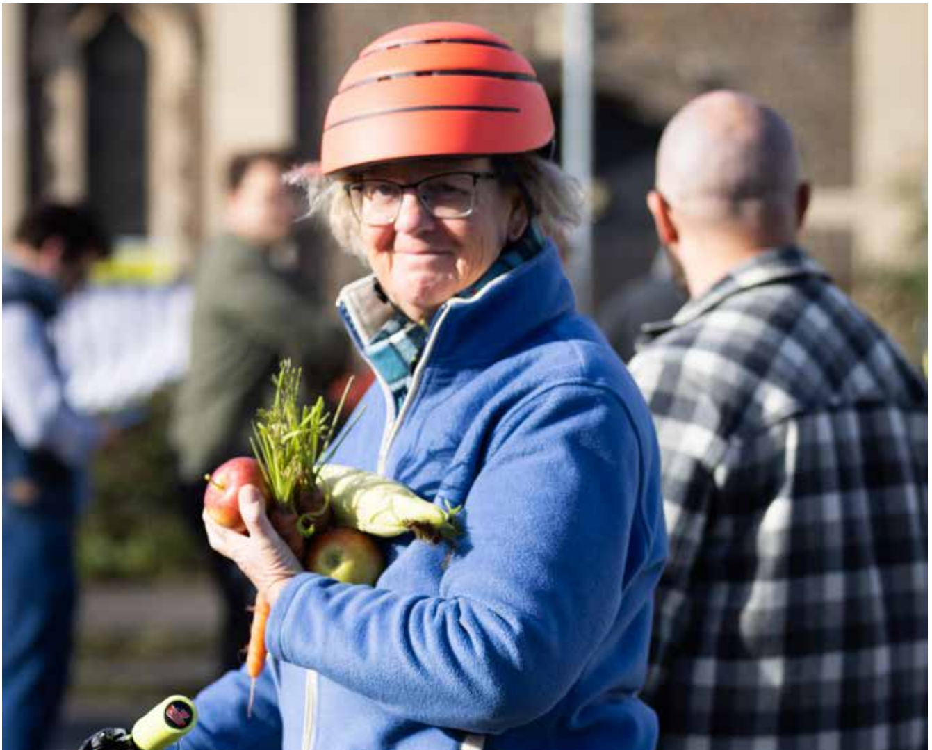
With veg from Cardiff Farmers Market