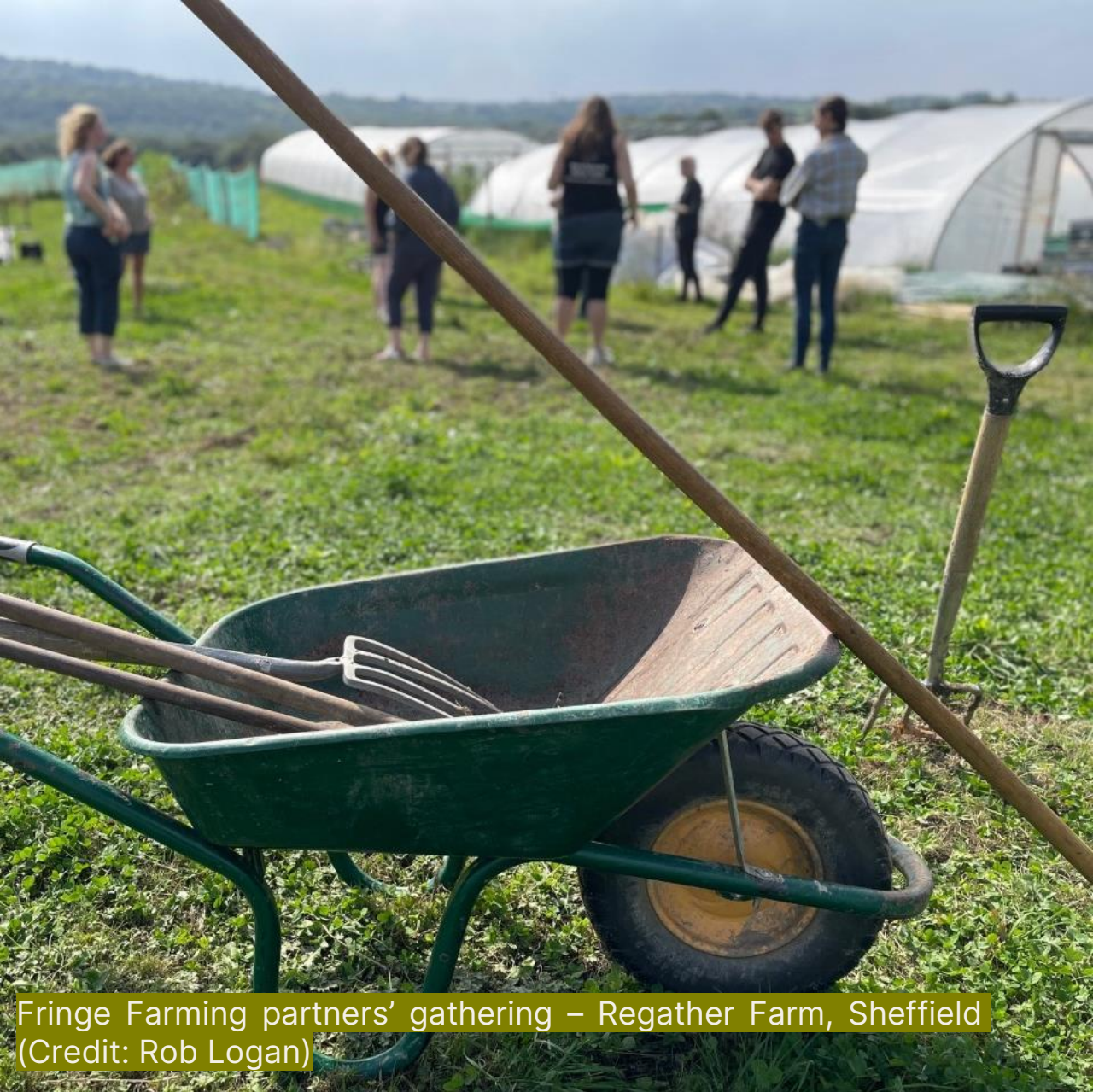
Fringe Farming partners' gathering – Regather Farm, Sheffield