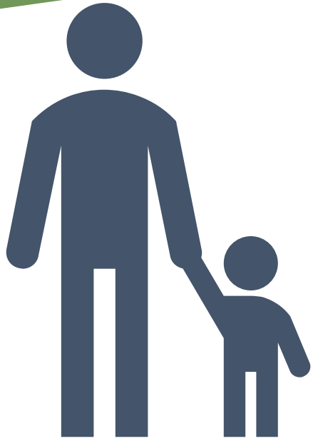
Over a quarter of children in poverty