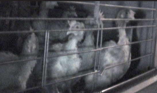
'enriched' cage production

In England the Government says “there is no scientific evidence to favour one (egg) production system over another, as each has its strengths and weaknesses”