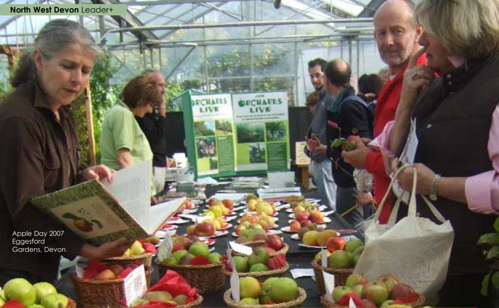
Apple Day 2007 Eggesford Gardens, Devon