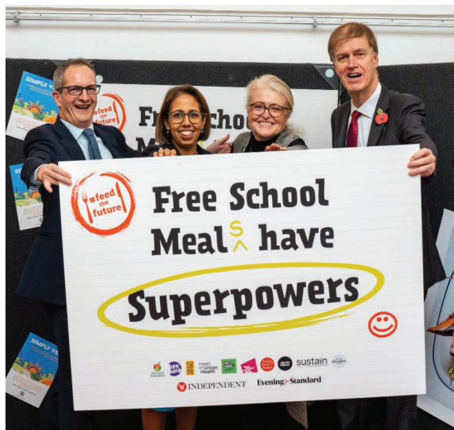
Cross-party political support for free school meals grows: Lord Bethell (Conservative peer), Munira Wilson MP (Liberal Democrat), Chair of Food Foundation Laura Sandys (former Conservative MP) and Stephen Timms MP (Labour) support launch of Free School Meals have Superpowers evidence pack.

Professor Ha Joon Chang , author of Edible Economics , keynote speaker at Sustain's Annual Conference 2022