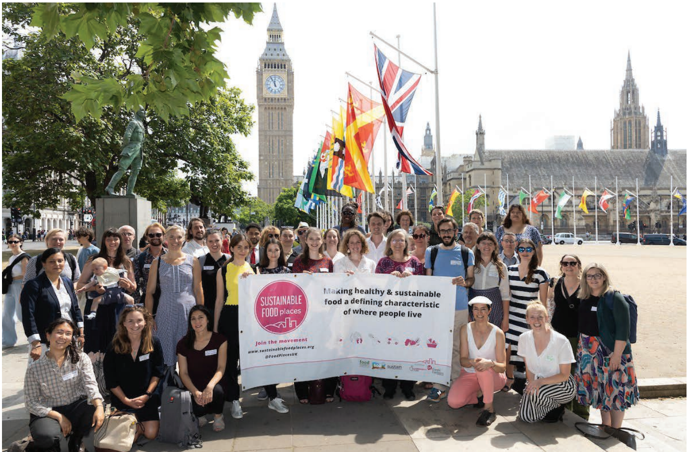
Leaders of local food partnerships from across the country gather for the Sustainable Food Places day of action and celebration in Westminster. The day was an opportunity to put the amazing work of food partnerships on the radar of local MPs, and to put out a call for: One food bill for every nation; One food plan and partnership in every local area.

The value of food partnerships was also evident in focused campaigns and initiatives coordinated by Sustain, helping local authorities and institutions to reduce the climate and nature impact of food